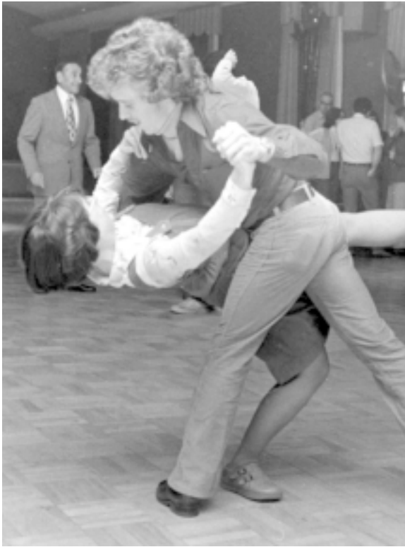
UConn Special Collections

What makes the '60s unique is that they are remembered by the general public as "political" years. In fact, unless one defines war as "political"—a debatable proposition, especially for World War II—then the '60s are the only political decade in "memory".