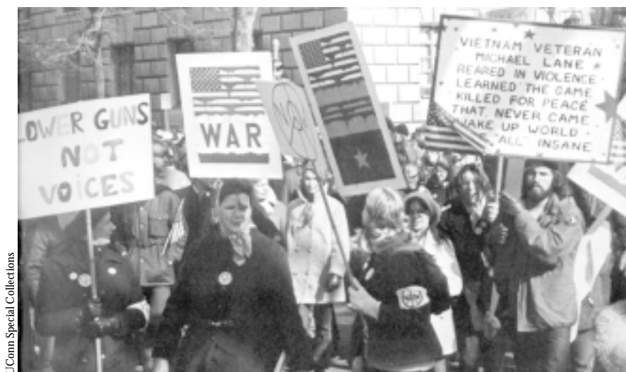
UConn Special Collections

Thinking about the era has one final, modern element. When the public starts recalling the '50s, the public also begins to express itself a whole lot more. There's